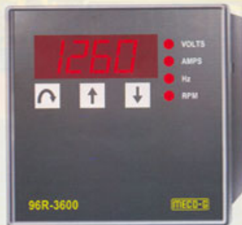
MODEL : 96R-3600

MECO-G has introduced a unique, low cost 4-in-1 meter for the first time. It has simultaneous measurements for VOLTS, CURRENT, FREQUENCY and RPM. This reduces the cost of using 4 separate meters and saves space on the panel. Wiring of cables is also reduced, effecting huge saving in cost.