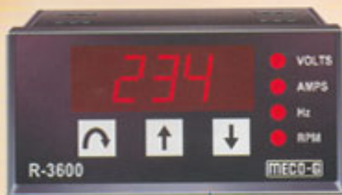
MODEL : R-3600