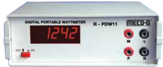
MODEL: R-PDW11/ R-PDW11L

Model: PDW11 (P.F.=1.0) Single Phase Unity P.F. PDW11L (P.F.=0.2) Single Phase Low P.F.