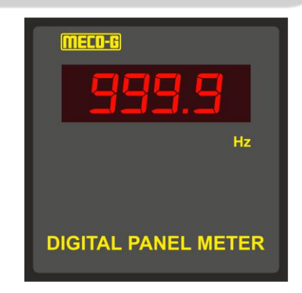
R-4050AN / BN